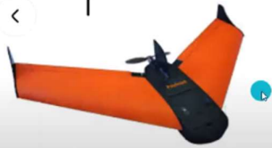
Fixed Wing Aircrafts